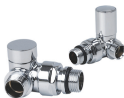
Crova Chrome Corner Valve