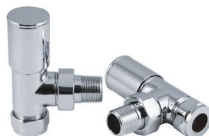
Portland Angled Chrome Valve